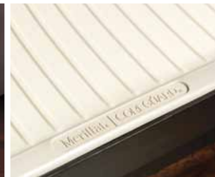
Raised ribs direct liquid flow