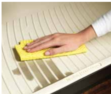
Easier clean up