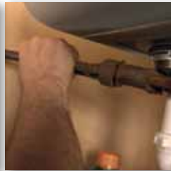
Bumps & knocks