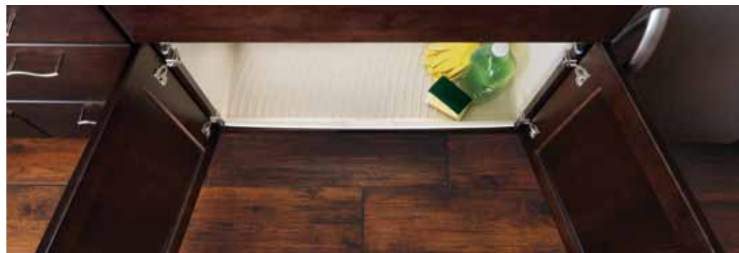
The CoreGuard™ Sink Base works with Merillat Classic® door styles